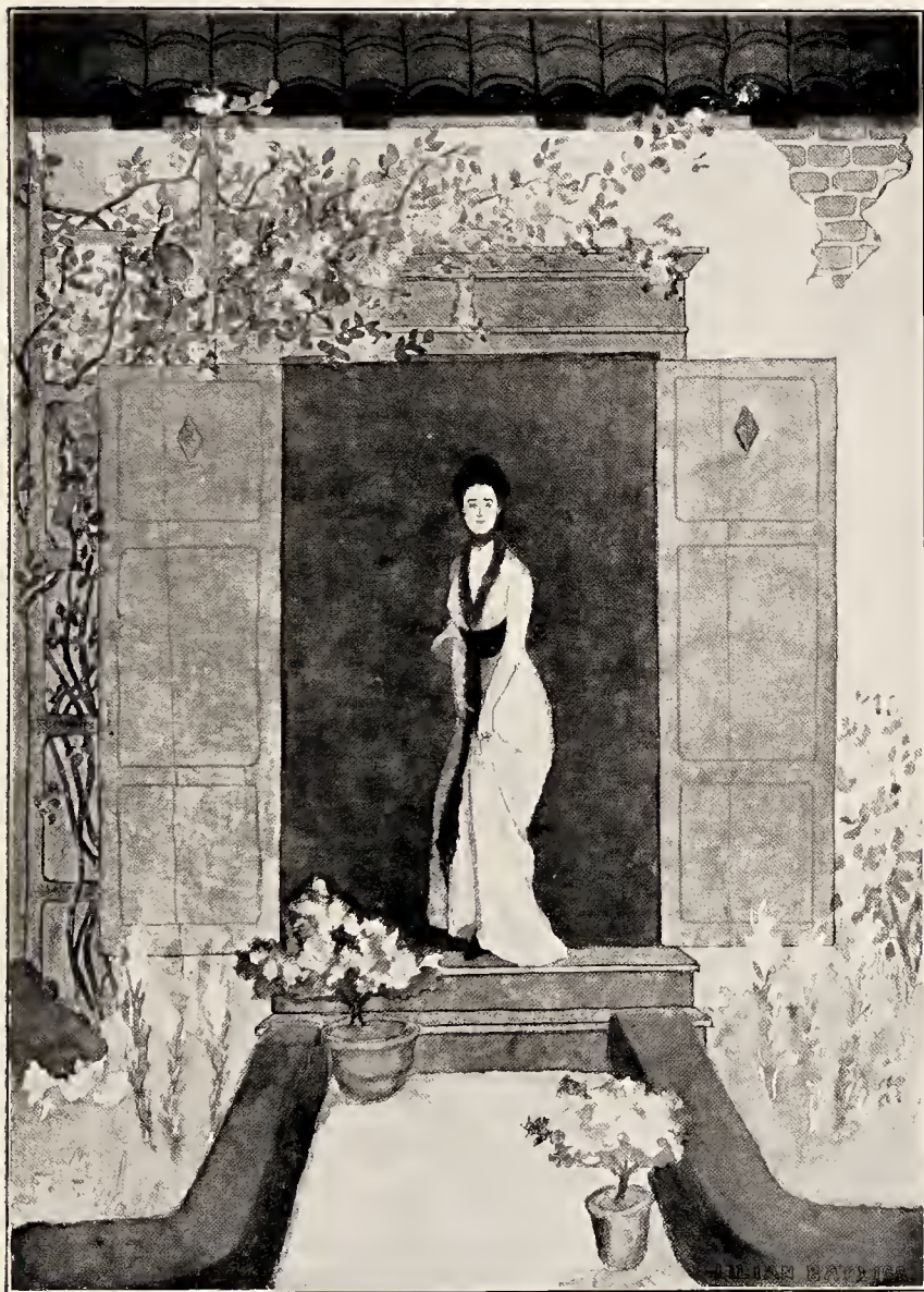
“A LADY STOOD IN THE VINE-COVERED DOORWAY.”